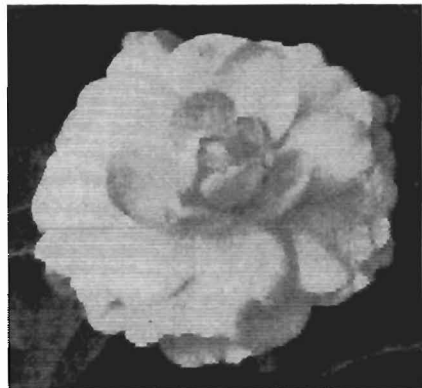
'E. G. Waterhouse' bloom