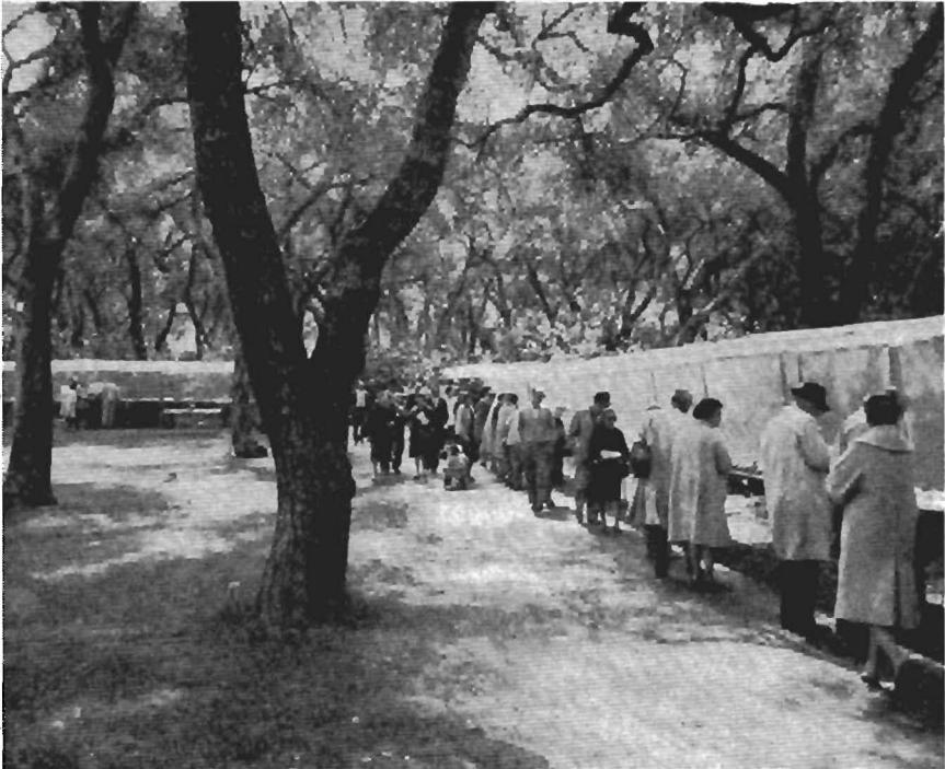
100 tables covered with plastic material were placed along the walks under the oak trees and among the growing camellias. The covering protected the blooms from sun and rain.