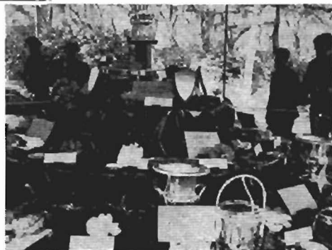
The trophy table at the Descanso Gardens show.