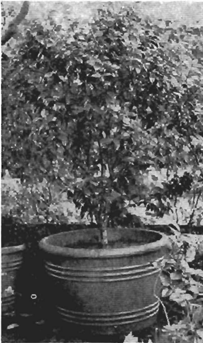
'E. G. Waterhouse' plant